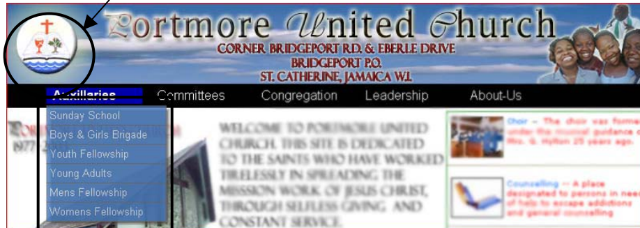
Figure 2. Available Menu Options

Dropdown menu gives access to other pages